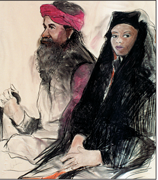
A recurrent theme burqa-clad women