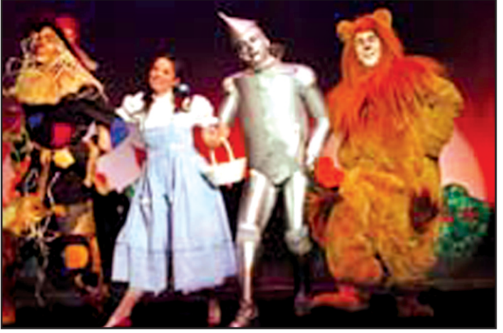
One of MGM's best loved films is The Wizard of Oz

Pictures, and Louis B Mayer Productions. The iconic studio has been in talks with bidders for