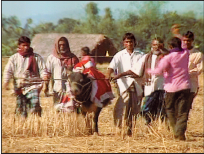
Two deadly bulls at an encounter with their horns

Recently a documentary titled Sharer Lorai was shown at the Spectra Convention Centre that focused on the extinguishing heritage of the rural Bangladesh. The whole documentary has been shot in the Bakol Jora village of Durgapur thana in Netrokona and directed by A Masud Chowdhury. Mohiuddin Tipu and Shumon Shikder wrote the script for this Eastern Panorama production.