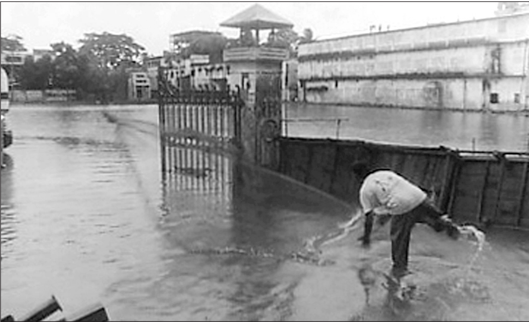
A town flooded with rain water... as all roads are under knee to waist deep water, a man is trying to net fish on the road at Kandirpar, in front of Comilla Town Hall. The photo was taken yesterday.