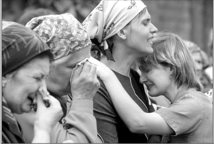
Relatives cry during the first funerals for the hundreds killed in the Russian hostage siege in Beslan.

BESLAN, an obscure corner of Russia in the Chechen region, has become the centre of world attention like few places have been in living memory. The brutal assassination of the hundreds of tiny tots inside a school is an act of barbarity, the parallel of which is hard to find. Nearly a week after the event, the dead count is still continuing. Beslan continues to be front page news to this day. According to unfolding reports nearly 1400 of whom nearly half were tiny children and the remaining parents, relations and assortment of people, whose identity is not clear, had assembled in the school for its opening after the summer holidays. They were immediately herded by terrorists with deadly weapons and devoid of the most minimum grain of humanity. From the ensuing