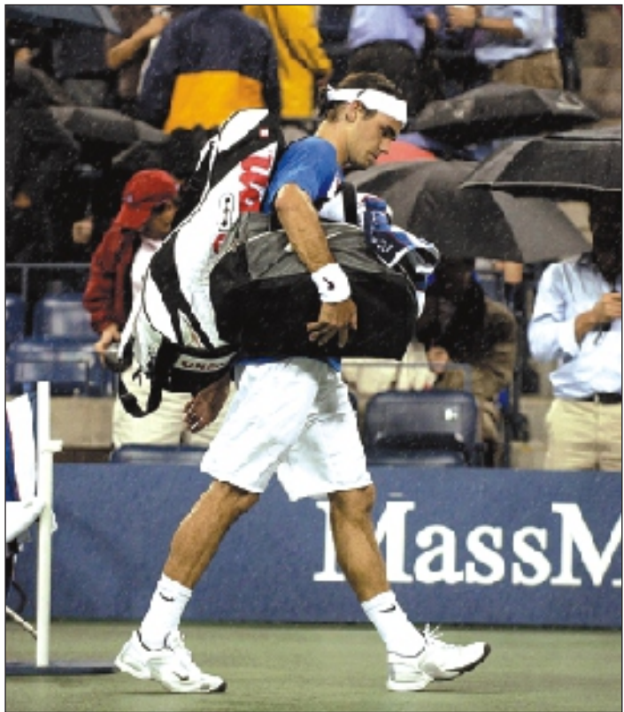
Top seed Roger Federer of Switzerland walks off the court as rain interrupts his match against American Andre Agassi during their men's quarterfinal at the US Open on September 8.