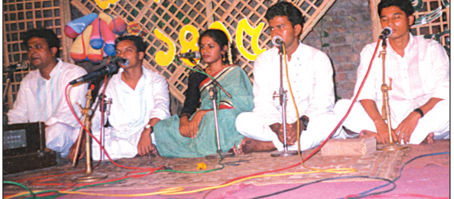
Artists of Muktakantha perform at a show

Muktakantha celebrated its 5th and 10th anniversaries. They also held programmes marking the hundredth anniversary of the noted poet Shukumar Roy. The introduction of the programme of Chaitra Shangkranti (The Eve of Bangla New