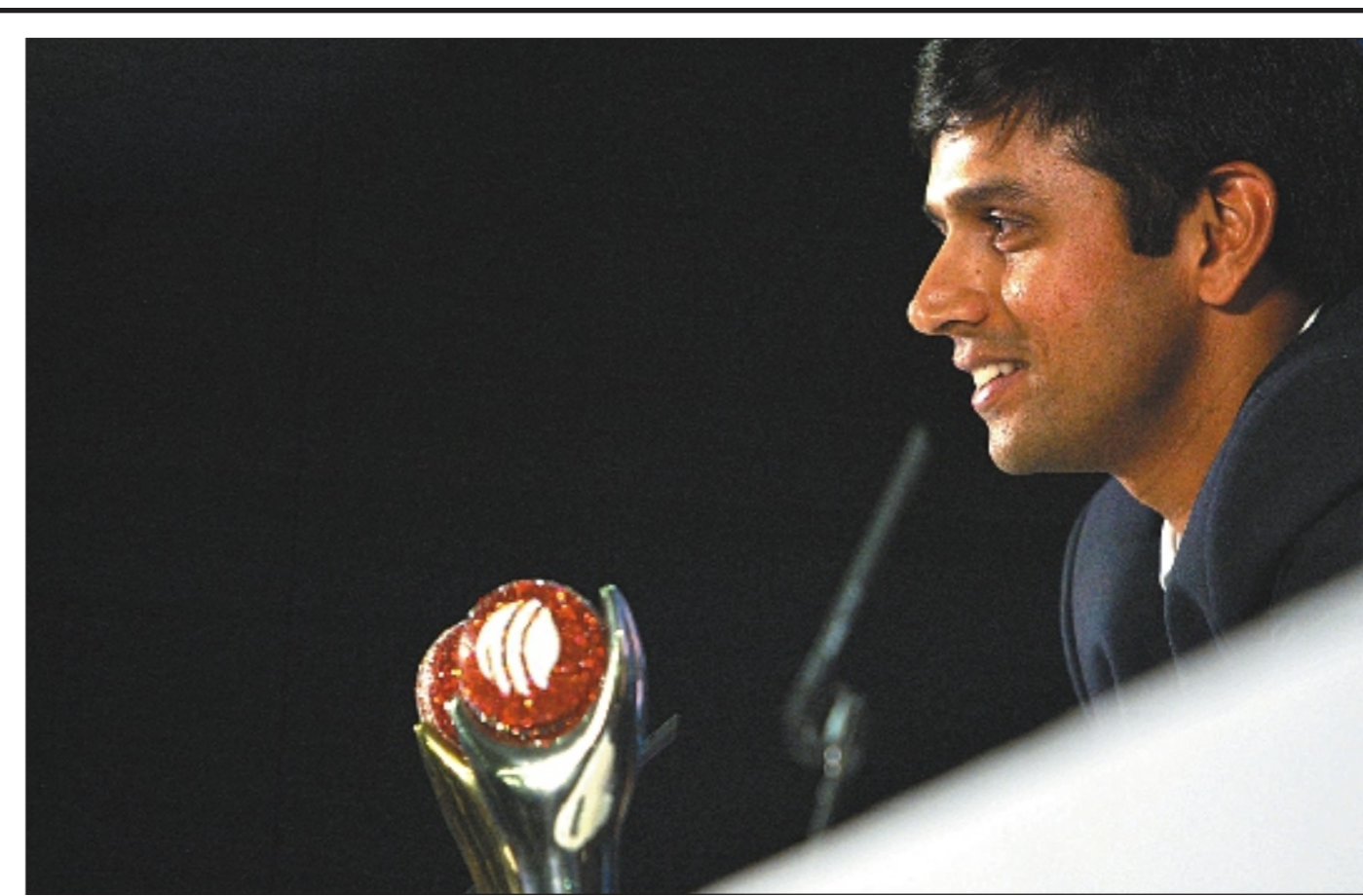
WALL OF THE WORLD: Indian batsman Rahul Dravid smiles while he sits in front of his two trophies at the ICC Awards ceremony in London on Tuesday.

Sept 11: India v Kenya, Rose Bowl Sept 14: Pak v Kenya, Edgbaston Sept 19: India v Pak, Edgbaston