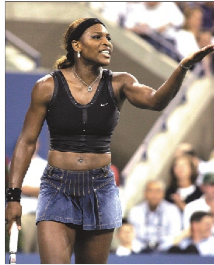
DON'T YOU SEE IT? American Serena Williams disputes a call during her fourth round engagement against Jennifer Capriati at the US Open on Tuesday.

Third seed Williams took the first set with two service breaks but the 28-year-old Capriati recovered her senses in time to set up a thrilling,