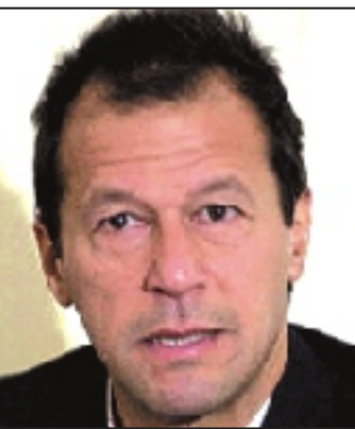
Imran Khan (Pakistan cricket legend)

"ICC should concentrate on disciplining the players, coaches and managers who are directly involved, even the heads of the boards can be checked but restricting officials like selectors is over policing." While lashing out at the game's ruling body's move to bar honorary cricket officials from questioning wrong umpiring decisions.