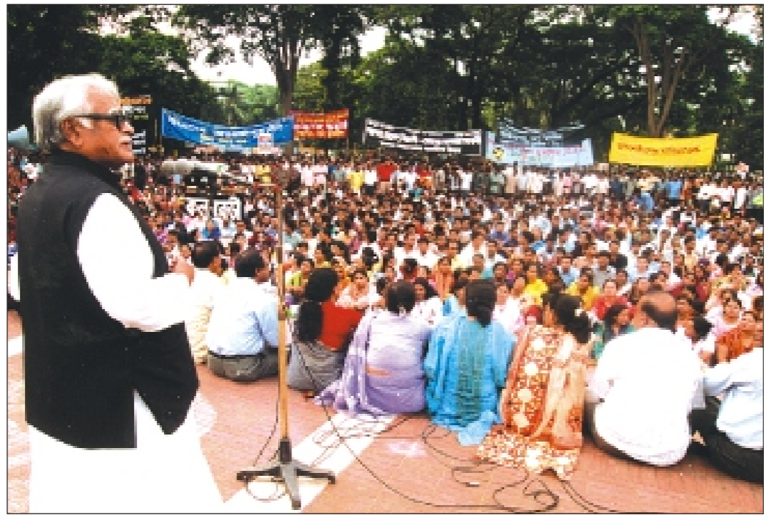
Awami League General Secretary Abdul Jalil speaks at a public meeting in the city organised by all front organisations of the main opposition party protesting the August 21 grenade attack on its rally on Bangabandhu Avenue.