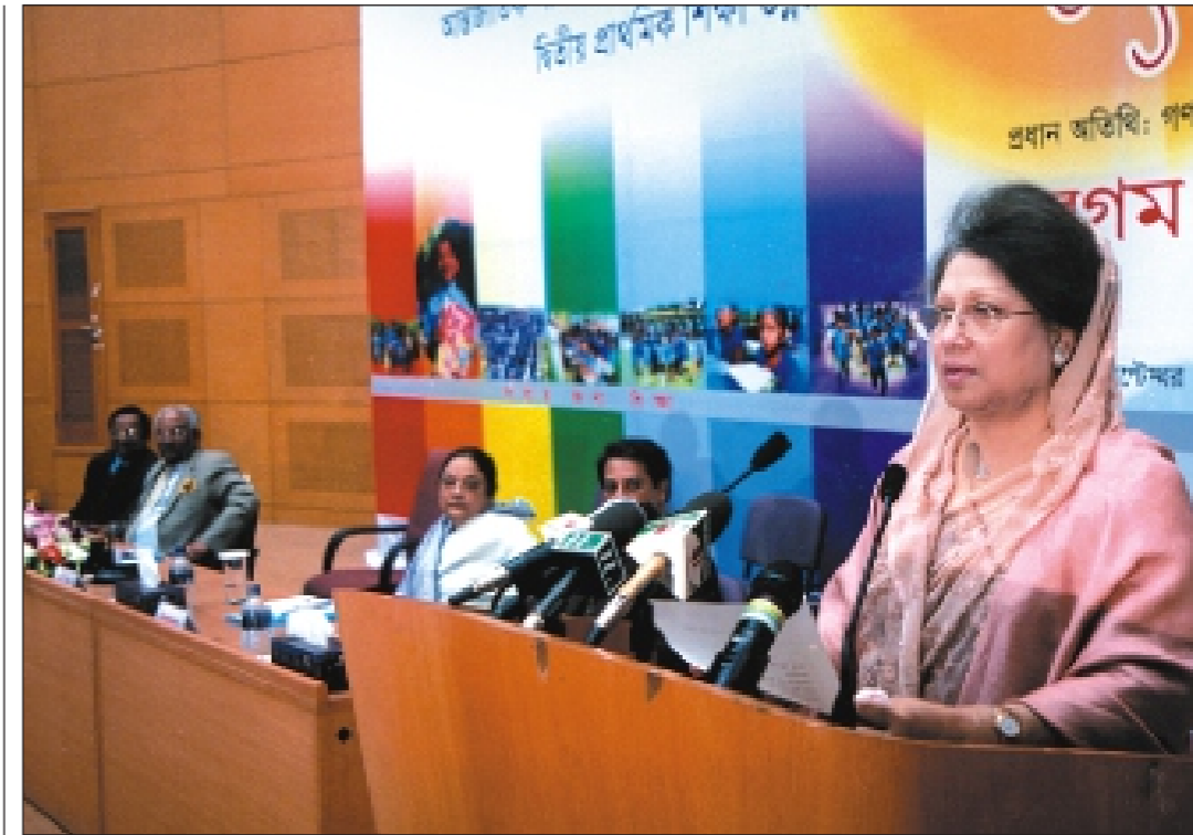
Prime Minister Khaleda Zia, right, speaks at the function organised to mark International Literacy Day and launch a Tk 5,000-crore Second Primary Education Development Programme in city yesterday.