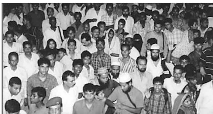
A partial view of the worried crowd of relatives (left) and police with microphone at Barisal BIWTA terminal in the early hours of Tuesday.