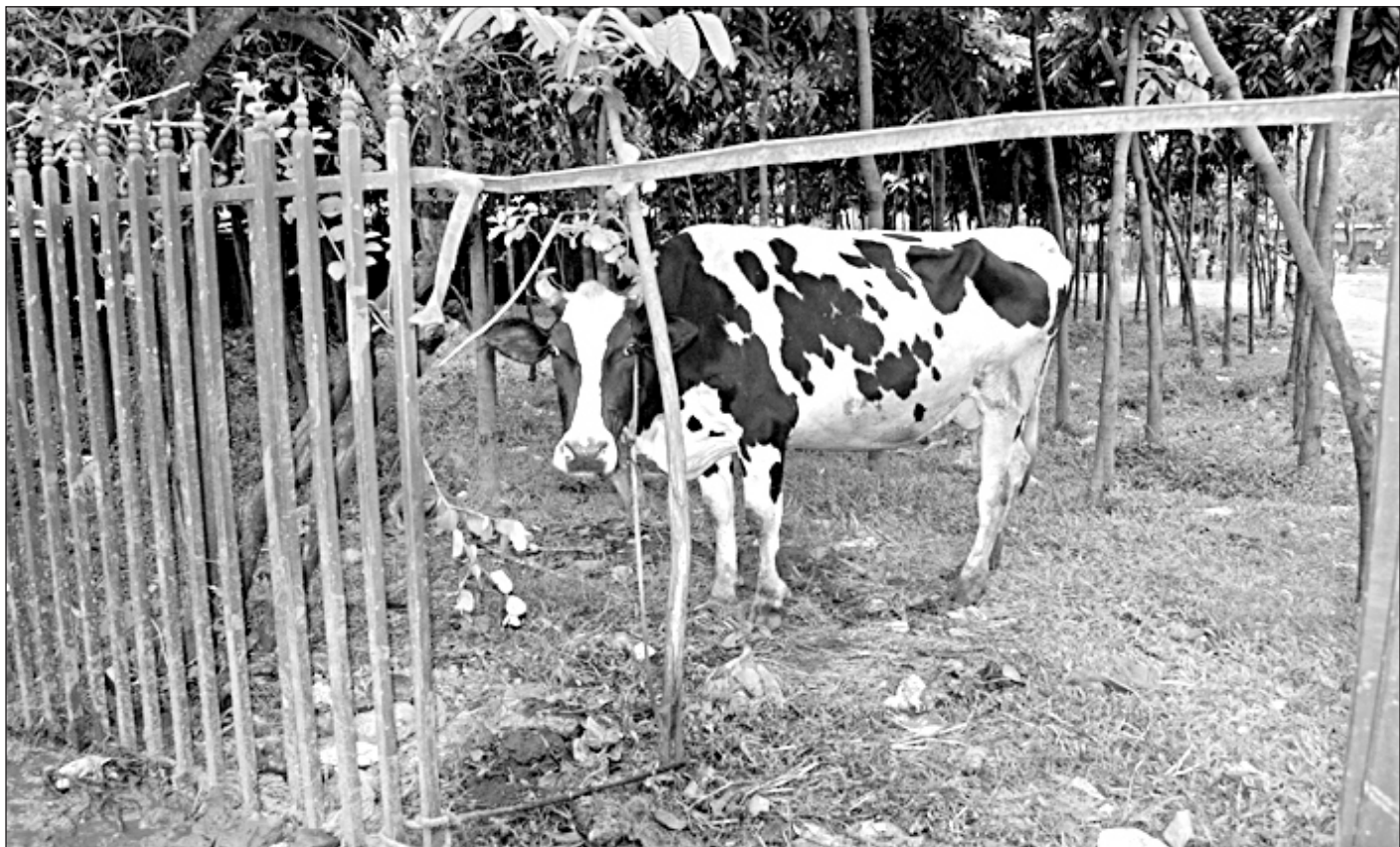
Cattle graze in an enclosure within Panthakunja park meant to keep the city healthy.