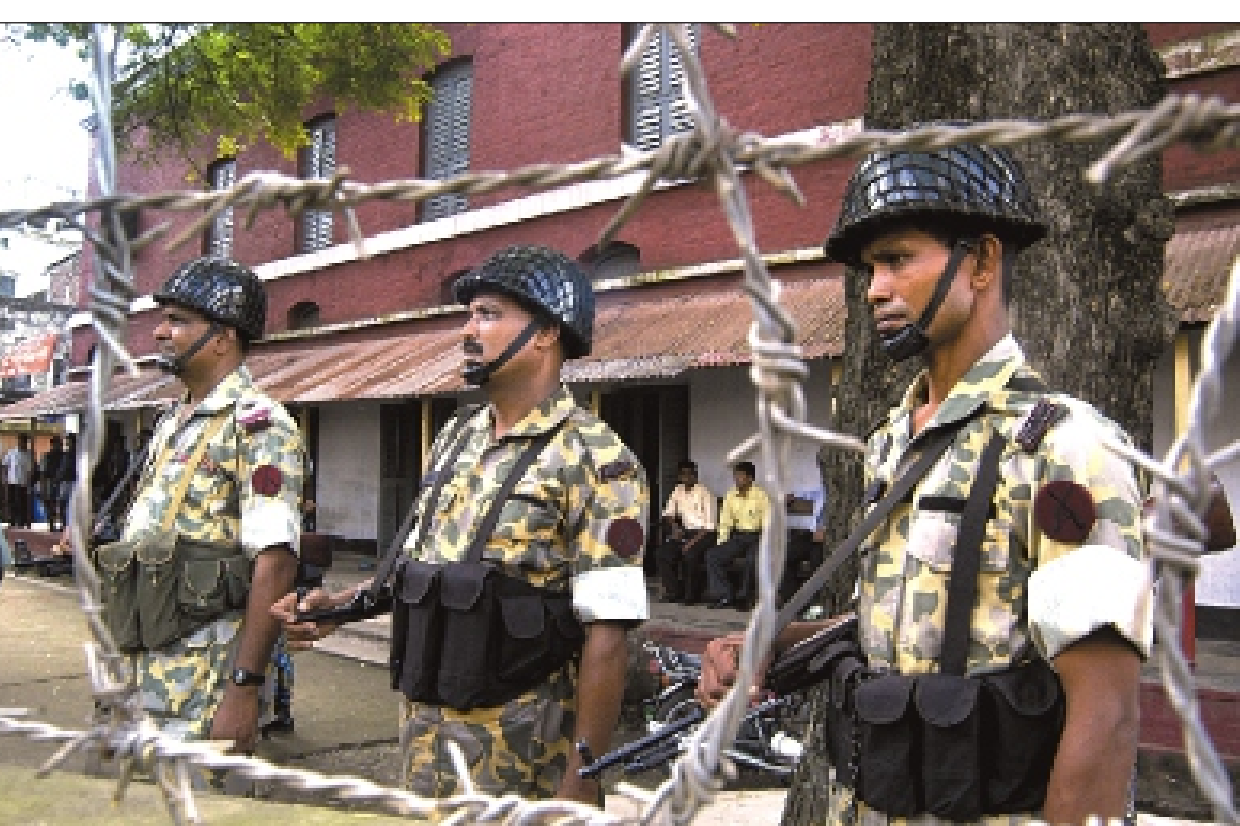
(L) Policemen harass journalists on duty in front of a makeshift court (near Dhaka Central Jail) set up for the verdict on the Jail Killing Case yesterday. (R) BDR members keep a vigil at the entry to the court.