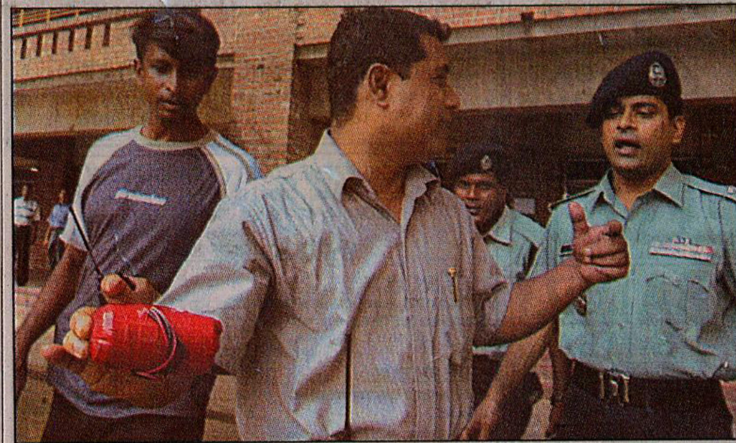
Police take away an explosive container, suspected to be a time bomb, found inside a toilet of Willes Little Flower School yesterday.