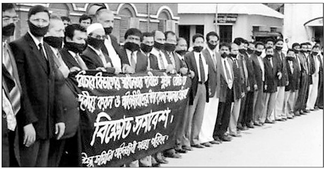
Mouths closed with black cloths, Barisal lawyers formed the human chain in the city on Sunday protesting 'politicisation of courts and attack on lawyers'.