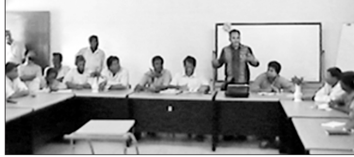
Uttaran, a local NGO, organised a roundtable on 'violence on women, human rights and legal aid' at Mobarakpur in Tala upazila in Shatkhira on Sunday.

The 15 had gone for fishing with the trawler FB Latachapl. The pirates were on board the F.B Khaja, they said.