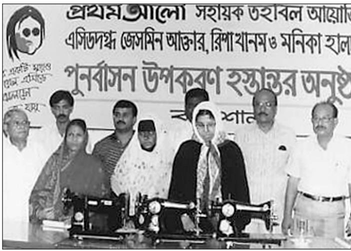
The three acid victims with sewing machines.