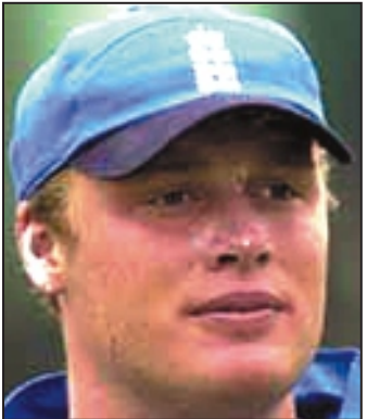
Andrew Flintoff (England all-rounder)

"I am more confident and I know my game a lot better, the way I play, and I am a bit more mature on and off the pitch."