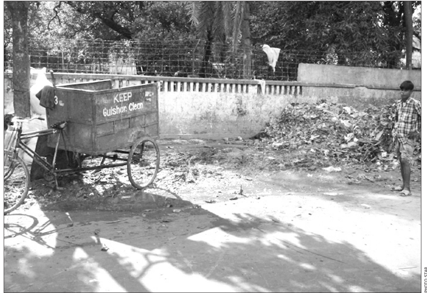
Garbage strewn beside a park in the heart of Gulshan 2 waiting to be collected.

"Slum dwellers living across the lake cross over to the other side at will on boats. They often litter the walkway bordering the lake and frequently dump their garbage in the water. Besides, the sound of their engine boats create noise pollution," said Gulrukh Rahman whose house is just beside the Gulshan Lake.