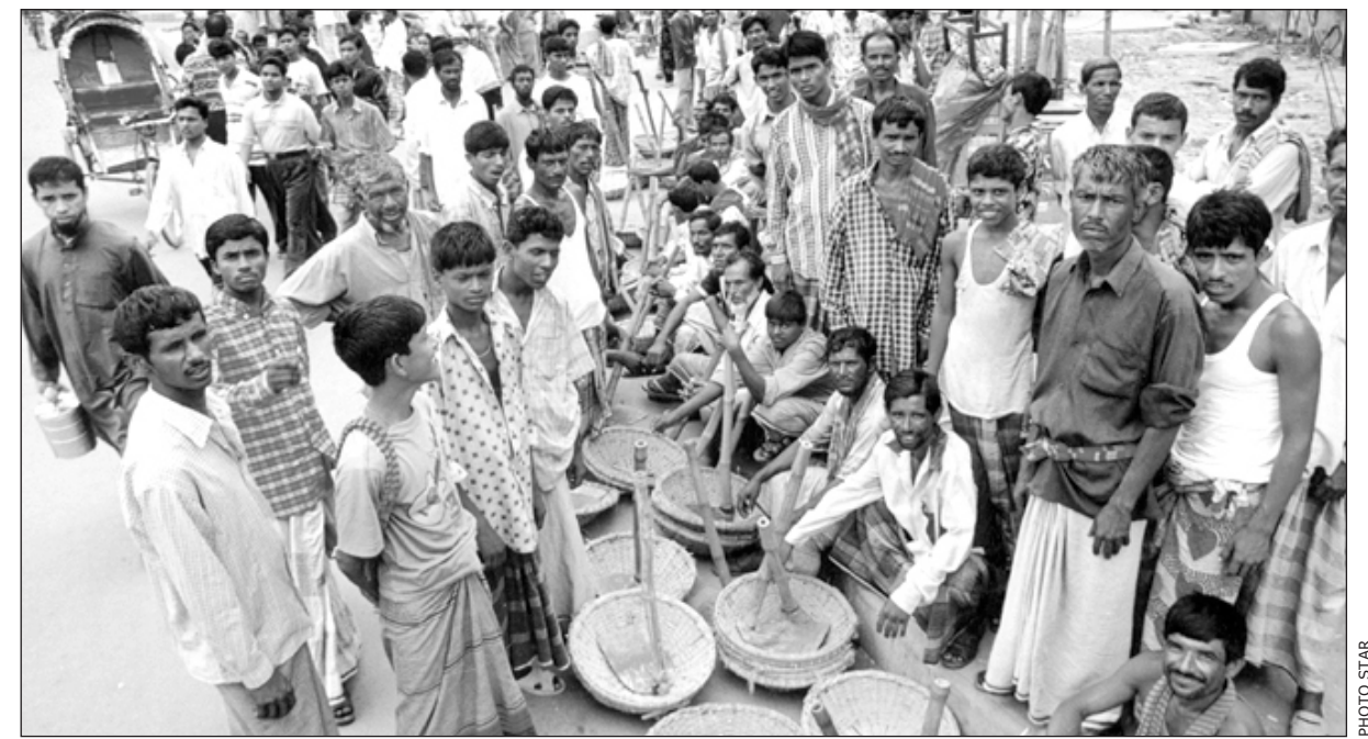
Up for sale ... Day workers gather at New Market early in the morning looking for a prospective employer. Unless they get one, they may have to go without food for the day.

Sometimes, customers directly hire labourers directly from the market.