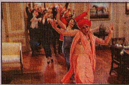
The Guru On Star Movies at 7:00 pm Genre: Comedy/Romance Cast: Heather Graham, Marisa Tomei, Jimi Mistry

All programmes are in local time. The Daily Star will not be responsible for any change in the programme.