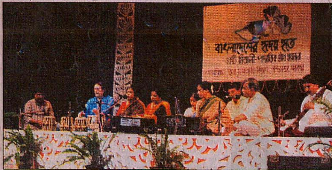
Bangladeshi and Indian artistes in a joint musical soiree