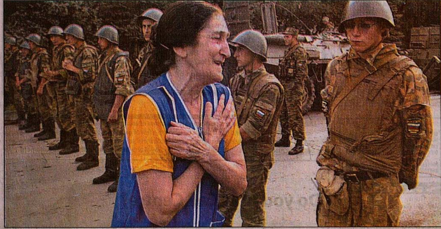
A woman cries in uncontrollable pain for her dear one in front of stone-faced Russian soldiers cordoning off the school at the end of a three-day hostage crisis.