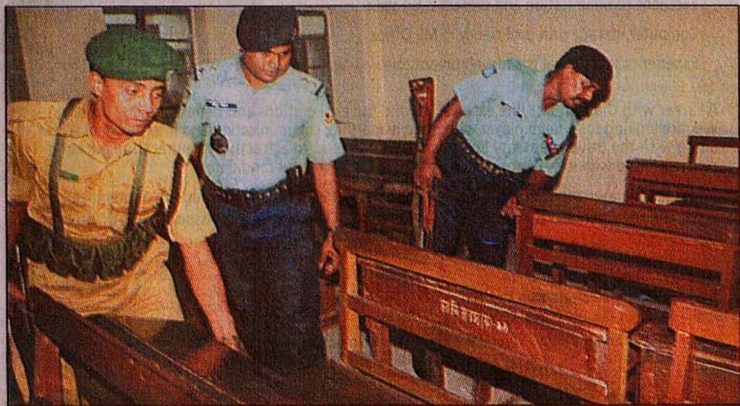
Policemen carry out a search at classrooms of Dhaka University yesterday after an anonymous letter on Friday threatened to blow up the Arts Building in five days.