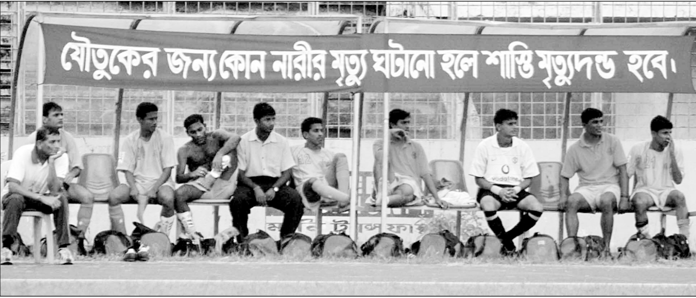
LET'S KICK DOWRY OUT! This photo taken yesterday shows a banner displayed on top of a team-bench at the Sher-e-Bangla National Stadium in Mirpur that says 'if a woman is killed for dowry, the perpetrator will be punished by the penalty'. The banner is part of a Bangladesh Football Federation initiative to create awareness against the evils of dowry.