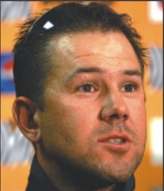
Ricky Ponting Australia skipper

"I'm not a fan of that sort of stuff. It's hard enough for the umpires to concentrate on what's going on without a lot of things going off in their ears."