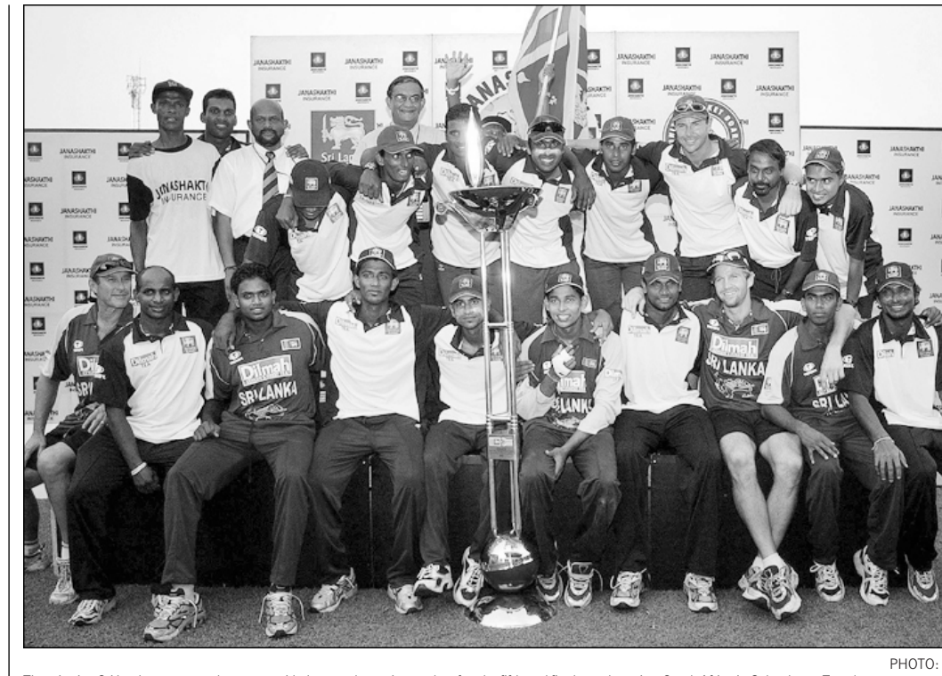
The winning Sri Lanka team members pose with the one-day series trophy after the fifth and final match against South Africa in Colombo on Tuesday