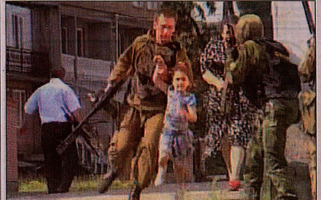
A TV grab taken from the Russian NTV channel shows Russian special police forces troops evacuating a little girl and her mother in the northern Ossetian village of Beslan, some 15 kilometres outside Vladikavkaz, yesterday.