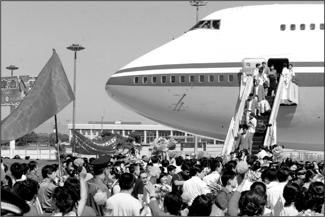
Chinese Olympians, who achieved their country's best ever performance in the Games, return to Beijing to heroes' welcome at the airport yesterday.