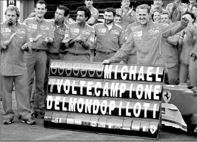
THE RED MACHINE: Ferrari driver Michael Schumacher (R) from Germany who won his seventh world title, poses with mechanics after the Belgian Formula One Grand Prix at the Spa-Francorchamps race circuit on Sunday.

Ferrari have dropped only 36 points all season and Todt hailed the team work that has kept them at the top of the sport.