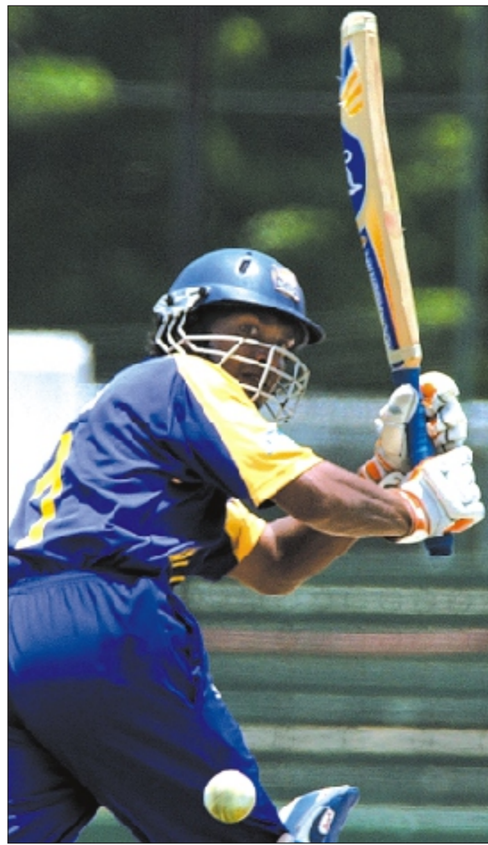
MAN-OF-THE-SERIES: Sri Lanka batsman Kumar Sangakkara flicks on way to scoring a solid 72 against South Africa in the fifth and final one-day international in Colombo yesterday.