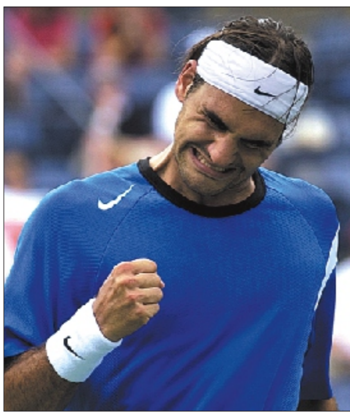
WOW WHAT A POINT! World number one Roger Federer of Switzerland shows his approval against Spain's Albert Costa in their US Open first round match in Flushing Meadows, New York on August 30.