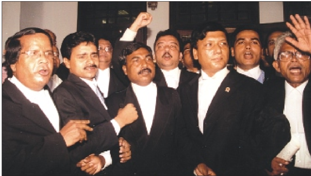
Lawyers loyal to Supreme Court Bar Association who boycotted the chief justice's court yesterday demonstrate, left, demanding cancellation of 19 additional judges' appointment, while some pro-government lawyers, right, enter the court amid police guard to carry on activities.