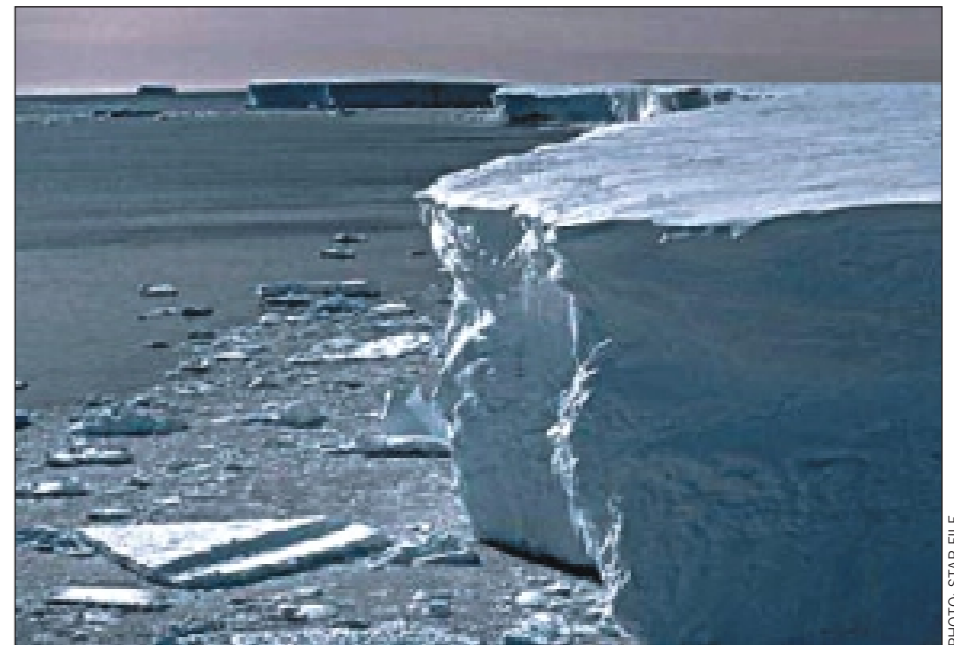
Antarctic ice shelf: One of the Earth's critical locations