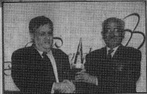
"Best Enterprise" of Bangladesh M M Ispahani Ltd.