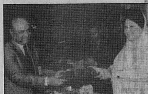
Bangladesh - Myanmar Trade Development Crest