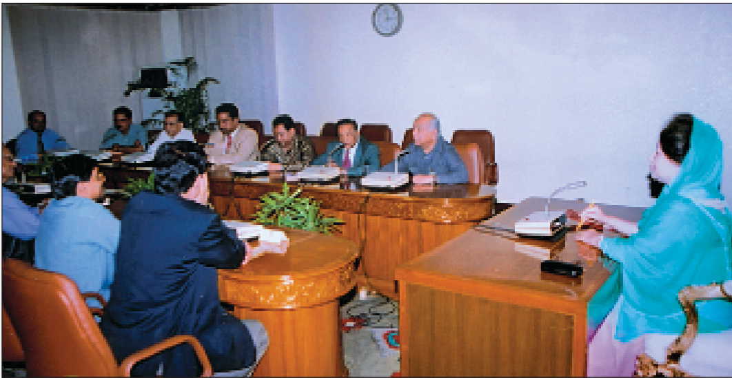
Prime Minister Khaleda Zia presides over a meeting with leaders of different business organisations at the Prime Minister's Office yesterday.

Republicans have opened their national convention to nominate President George W. Bush for a second term with plans for four days of tributes to his wartime leadership and his response to the September 11, 2001, attacks. The opening session will be highlighted by a tribute to victims of the September 11 attacks and a salute to Bush by two party leaders who appeal to moderates, former New York Mayor Rudolph Giuliani and Arizona Senator John McCain. "He has been tested and has risen to the most important challenge of our time, and I salute him," McCain said of Bush in prepared excerpts of his speech released by the campaign on Monday. Republicans start the convention in an upbeat mood after several new polls showed Bush gaining ground and slightly leading his Democratic challenger, Senator John Kerry of Massachusetts. The gathering is in New York, less than four miles (7 km) from the gaping hole where the World Trade Centre once stood, in part to remind voters of Bush's leadership after the attacks. Three victims' relatives will SEE PAGE 11 COL 4