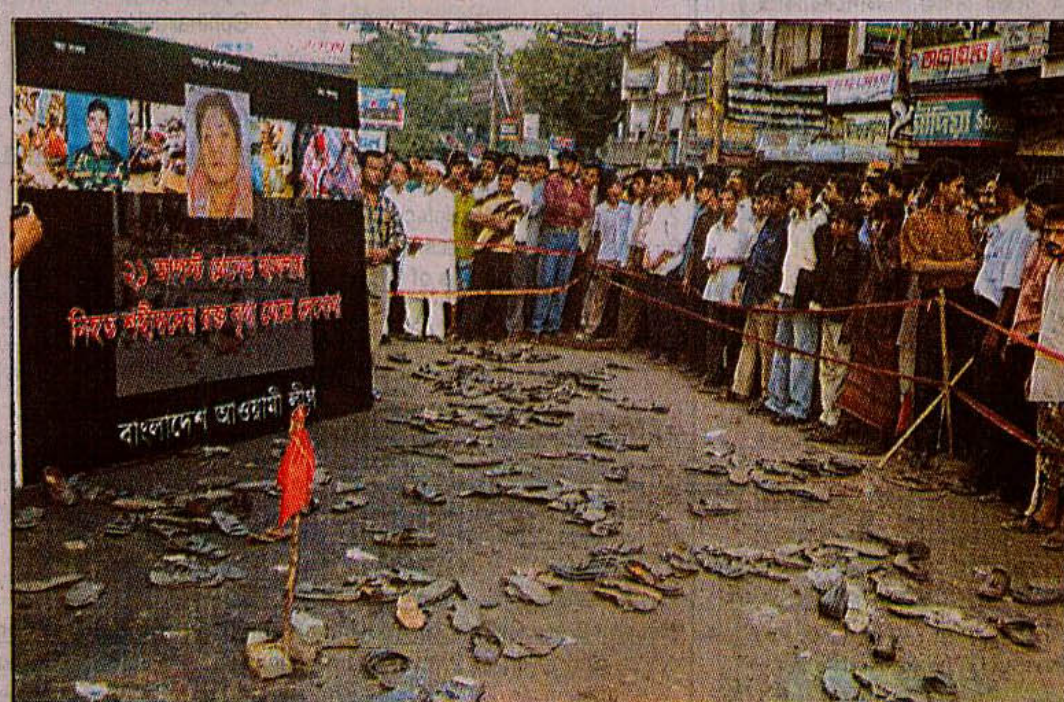
A crowd watches a photo montage the Awami League put up yesterday at the scene of the August 21 grisly grenade blasts in its rally on Bangabandhu Avenue that killed 19 and wounded 200 others.