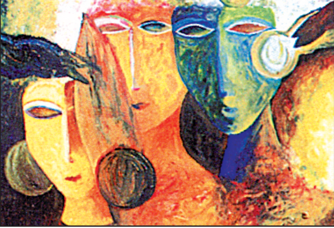
Dream by Afifa Akhter Lia

Shumanta's Village , an oil painting, presented buffaloes with golden haystacks at the back and tall date palms at the side. Included were men threshing rice. The creation was in gold, greens and grays. Lucky's landscape, also in oil, had a peaceful rivulet with a gray-blue sky at the back, above the gray-green hills.