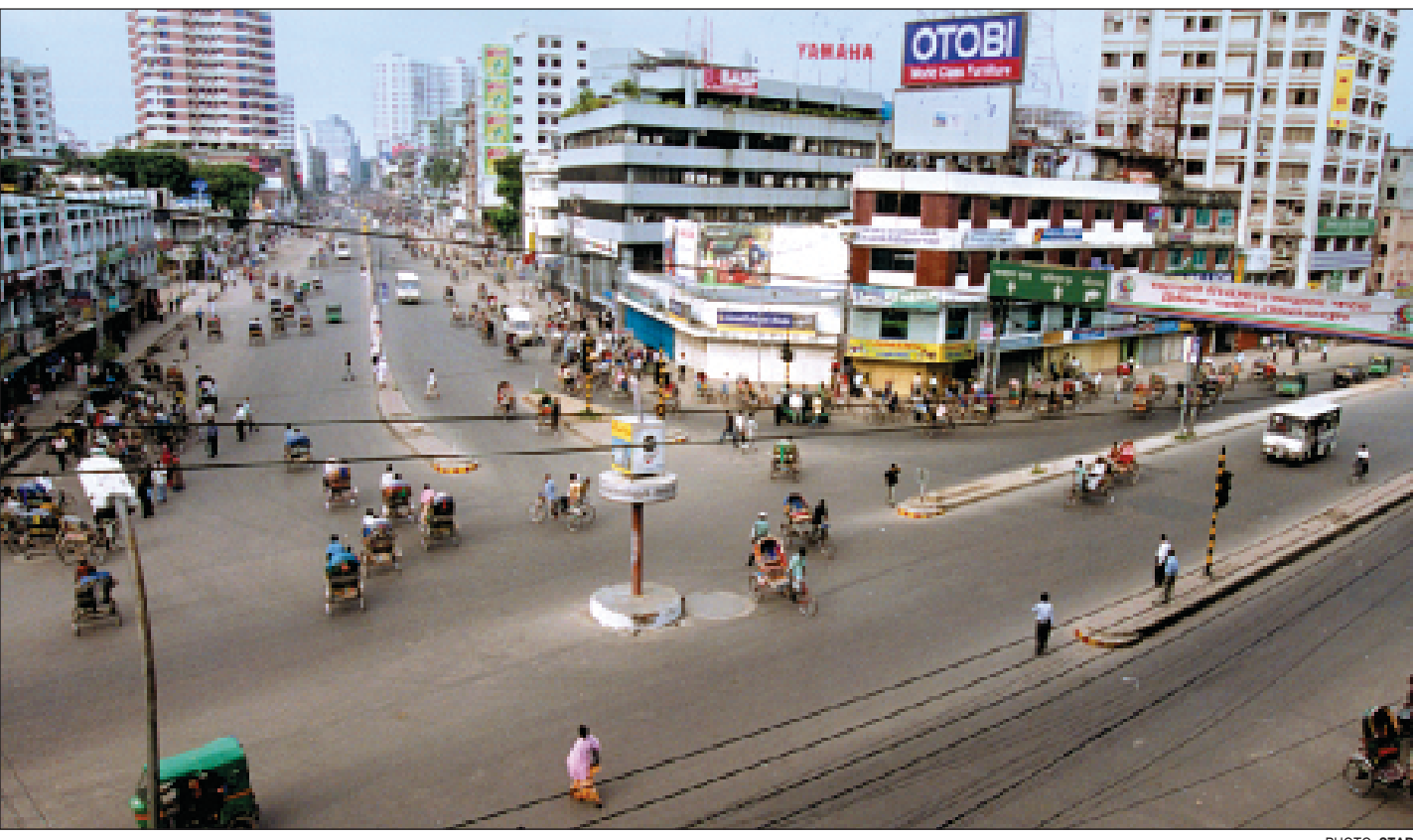
Kakrail Crossing looks almost barren as traffic thinned out on the streets of the capital during yesterday's dawn-to-dusk countrywide hartal.