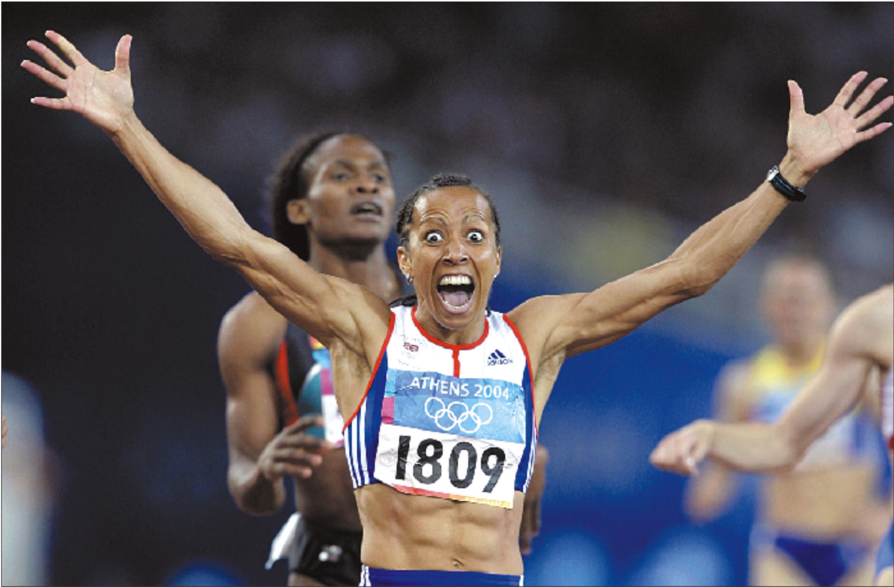
THIS IS TOO GOOD TO BE TRUE! Britain's Kelly Holmes is ecstatic as she crosses the finish line of the women's 800m event at the Olympic Stadium on August 23. Favourite Maria Mutola (L) of Mozambique came fourth.