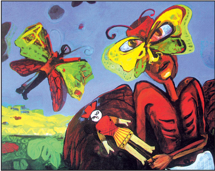
Still we dream