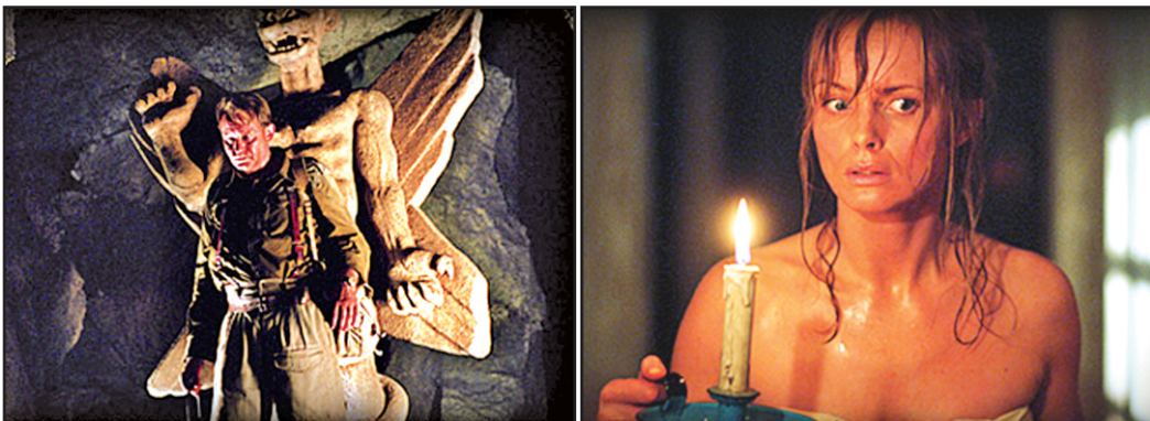
A still from the new Exorcist movie

Exorcist: The Beginning is the fourth Exorcist movie, with two sequels released in 1977 and 1990.