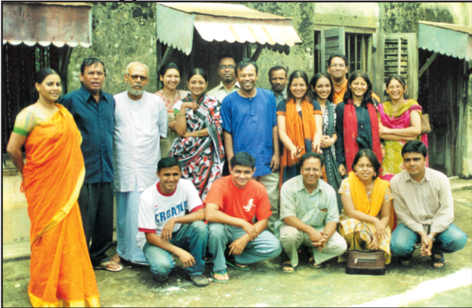
The cast of the drama serial Enechhi Shurjer Hashi