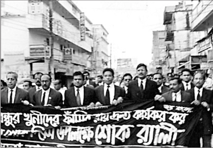
Awami Ainjibi Parishad brought out a procession in Barisal city (left) and party leaders and activists paraded streets of Comilla town (right) yesterday demanding execution of Bangabandhu murder verdict.