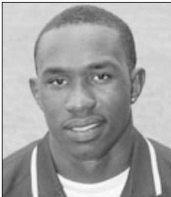
BRAVO... 6 for 55

defeat at Lord's and has been a rare bright spot for the West Indies on tour, finished with Test-best figures of six for 55. Thorpe made a brave 114, with fast-landing a torrid short spell from final