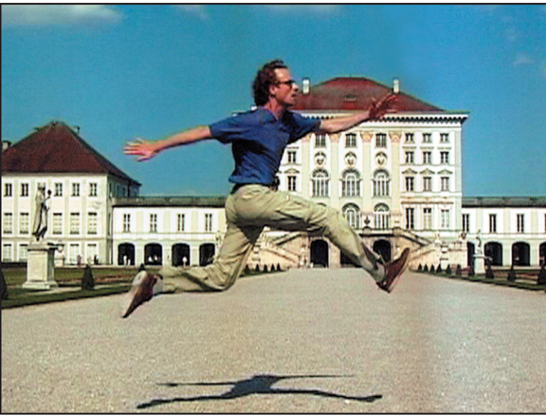
Stills from the videos