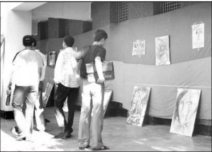
Visitors watching paintings at the exhibition

Speakers, at the function, said, that art is universal and transcendence time and place. It might be one of the most effective means of awareness building program on HIV/AIDS. Many of the messages on killer disease AIDS can not be easily explained through words but can be expressed through the paintings.