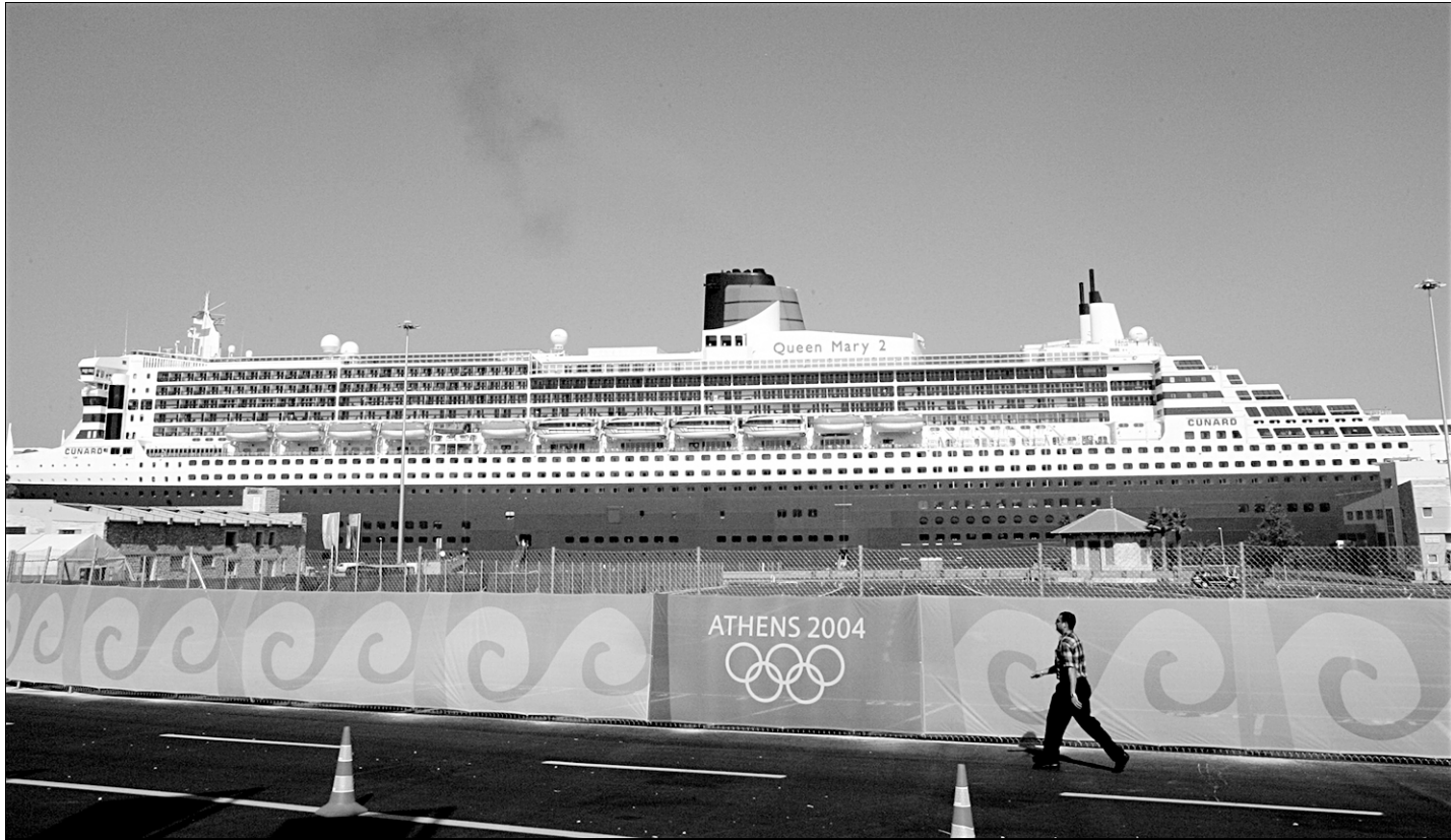
A pedestrian walks past a giant Olympic banner in front of the world's largest luxury liner Queen Mary 2 after its arrival at the Port of Piraeus yesterday, two days before the opening ceremony of the Olympic Games in Athens.