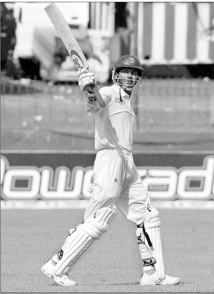
SUPERB SANGAKKARA: Sri Lanka batsman Kumar Sangakkara acknowledges the crowd's applause on reaching century on the first day of the second and final Test against South Africa at the Sinhalese Sports Club ground in Colombo yesterday.

aries in the penultimate over to carry Sri Lanka past 300 and himself past 150 for the third time. The previous two times he passed 150, he went on to score double centuries. The 26-year-old left-hander came to the crease in the first over after captain Marvan Atapattu smashed one cover drive for four before nicking a Shaun Pollock outswinger to Boucher. After a tricky half hour against the new ball, Sangakkara then counter-attacked with Jayasuriya, adding 95 for the second wicket, to push South Africa onto the defensive. Jayasuriya, perilously close to being lbw on one and then fortunate when he slashed through the slips, was unlucky to be dubiously adjudged lbw shortly before lunch to Boje. Pollock was South Africa's most threatening bowler, who finished with one for 49 from 16 overs. Sri Lanka made two changes to the team that drew the first Test in Galle with record-breaking spinner Muttiah Muralitharan ruled out with an injured shoulder. He was replaced by left-arm spinner Rangana Herath while fast bowler Lasith Malinga replaced all-rounder Farveez Maharoof. South Africa recalled Herschelle Gibbs after an ankle injury in place of all-