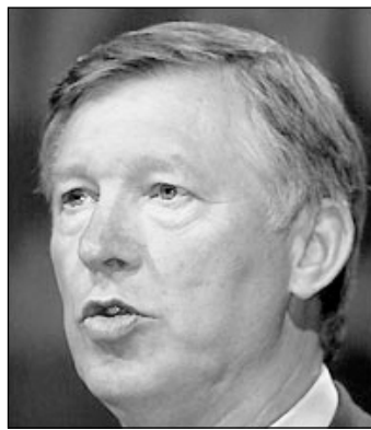
SIR ALEX FERGUSON