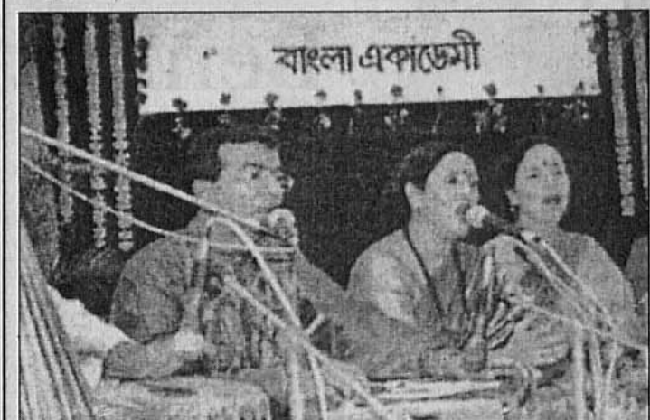
Papya Sarwar rendering a chorus with the students of Geetoshudha

After the gripping discussion, acclaimed Rabindra Sangeet artiste Papya Sarwar mesmerised the crowd with her solo performance. She started with O amaar desher mati in chorus with the students of Geetoshudha . Then she rendered Jodi tor daak shuney keu naa ashey in chorus too. The audience were quite surprised as it was the solo