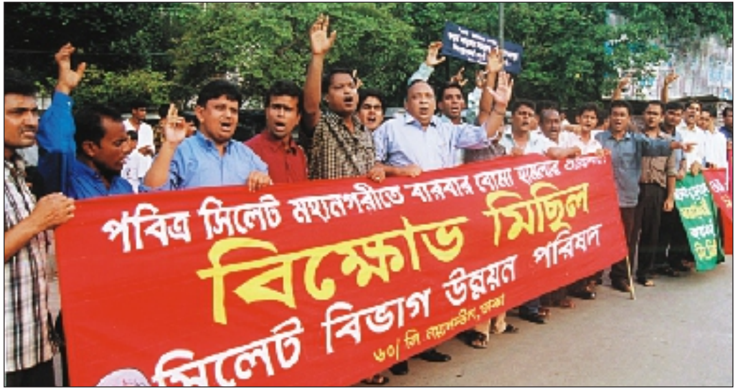
Sylhet Bibhagh Unnayan Parishad forms a human chain at Muktangan in the city yesterday protesting repeated bomb attacks in Sylhet.