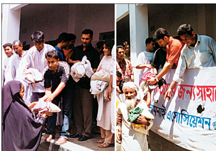
The Alumni Association of Bangladesh Krira Shiksha Protisthan gave away food and used clothes to flood-hit people on the Piar Sattar Latif High School premises in Bandar, Narayanganj recently.