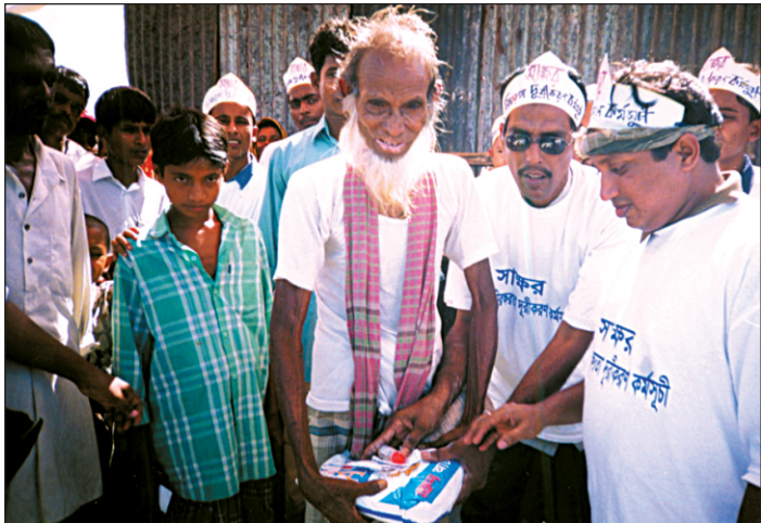
Sakkhar, an organisation working to eliminate illiteracy, has started a relief operation for the flood victims at Nunertek in Sonargaon, Narayanganj.