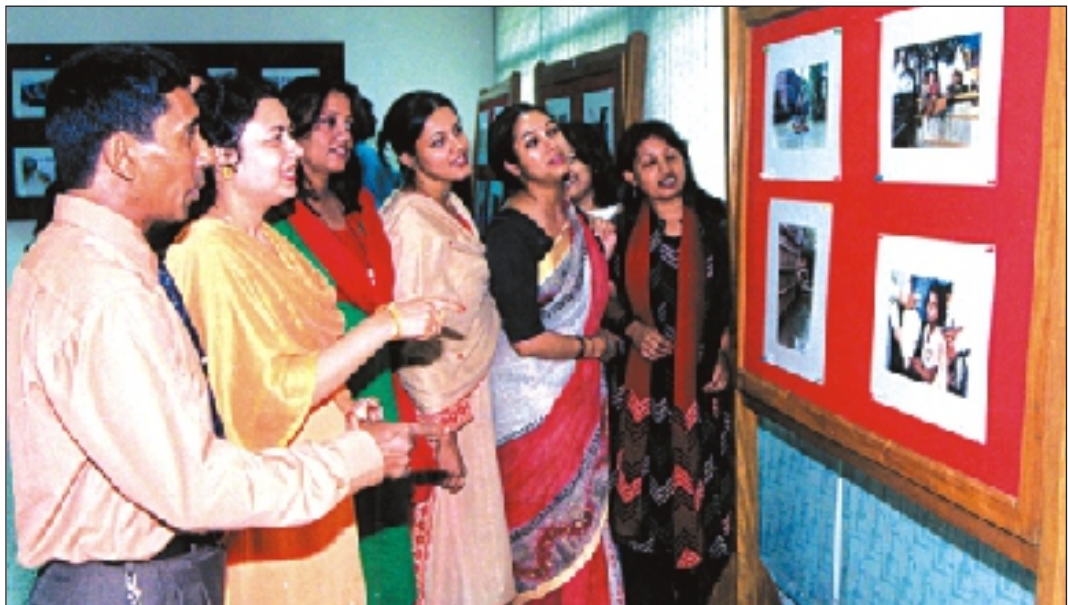
A five-day photography exhibition titled 'Banbhasi Shishu-2004' (flood-affected children) began at the National Institute of Mass Communication in the city on Sunday. About 50 photographs by the participants of a training course on 'Photojournalism: method and technique' have been put on display. The exhibition will remain open from 10.00am to 8.00pm daily till August 12.