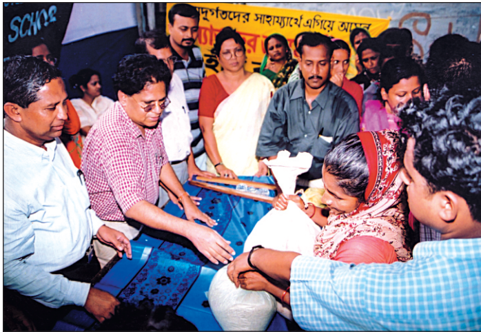
Teachers, students and guardians of Heed International School distribute relief among the flood-affected people at Sutrapur in the city yesterday.