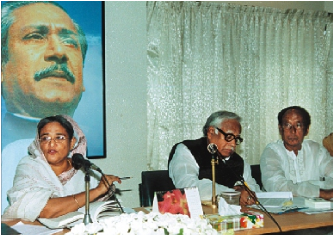
Leader of the Opposition in Parliament and Awami League President Sheikh Hasina speaks at the Awami League Central Working Committee (ALCWC) meeting at the party's Dhanmondi office in the city yesterday.

Academy Film Society will screen two American films titled 'When Harry Met Sally' (1989) and 'Body Shots' (1999). Venue: Society Auditorium, 21/C Jigatola. Time: 6.30pm and 8.30pm.