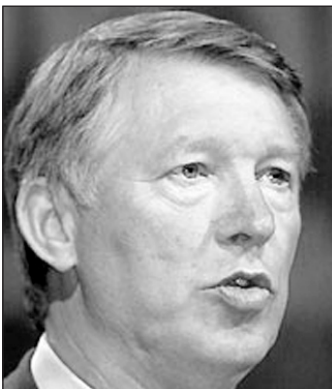
SIR ALEX FERGUSON

Wenger and Ferguson were due to cross swords once more on Sunday when their teams meet in the Community Shield and the