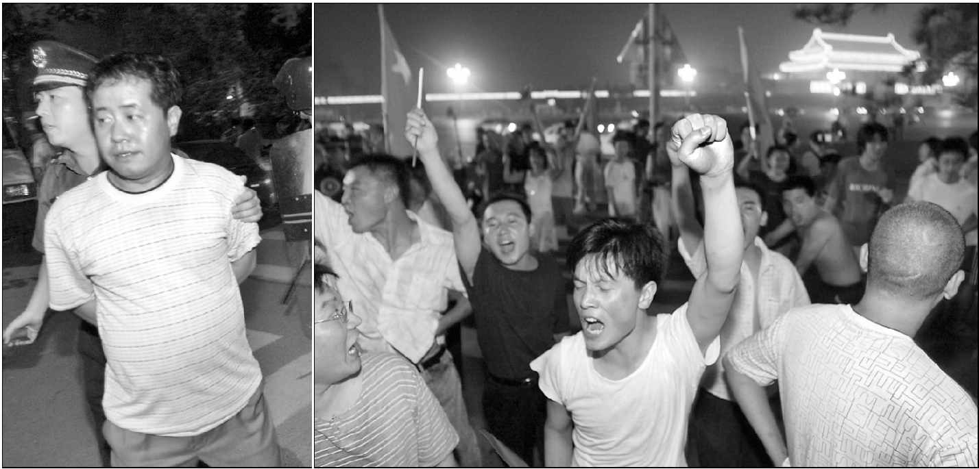
FURY IN BEIJING: (L) A Chinese fan is led away by a policeman. (R) Emotion spills on to the streets as angry supporters voice their frustration after watching the hosts go down 3-1 to Japan in Asian Cup final.