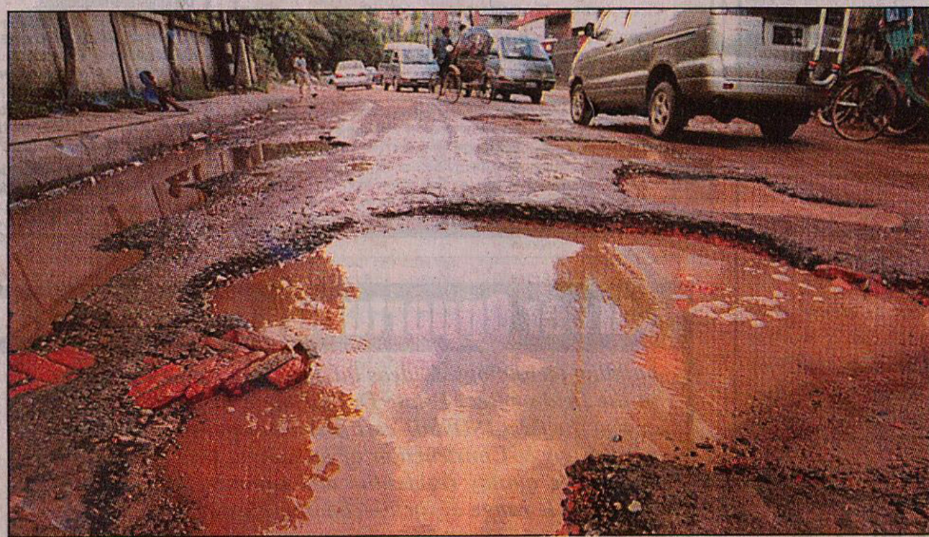
Traffic negotiates the pothole-strewn road No. 27 K in Banani yesterday as the floodwaters have left roads in the capital severely damaged.