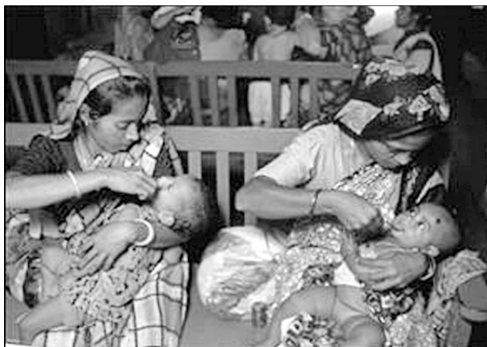
Two women sit on a bench spoonfeeding their babies a rice-based oral rehydration solution at the International Centre for Diarrhoeal Disease Research in Dhaka, Bangladesh.

Diarrhoea can also spread from person to person, aggravated by poor personal hygiene. Food is another major cause of diarrhoea