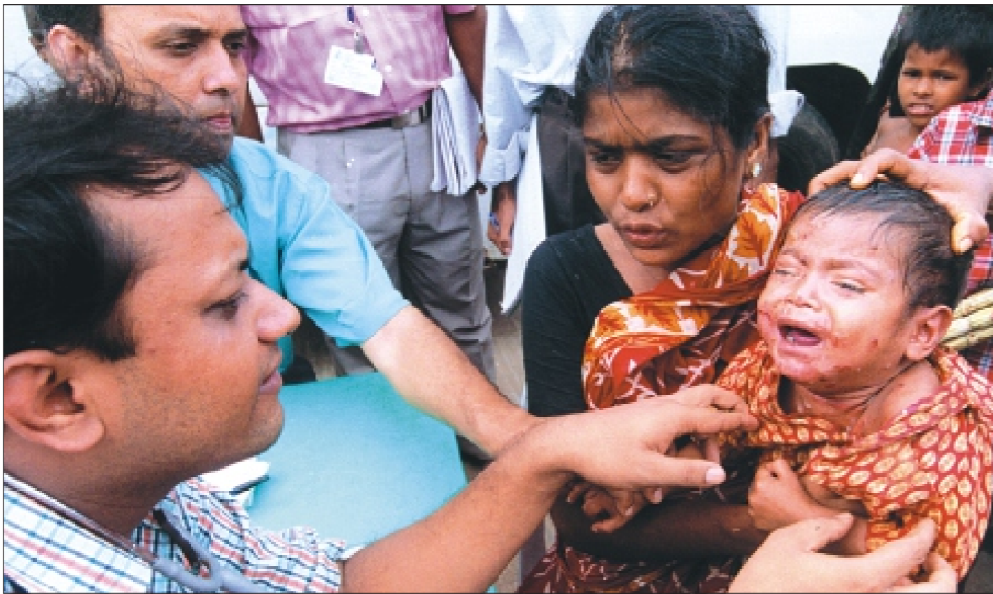
Doctors of Marie Stopes mobile clinic take a look at a sick baby on his mother's left hip in front of the Martyred Intellectuals' Memorial at Rayerbazar in the capital yesterday.