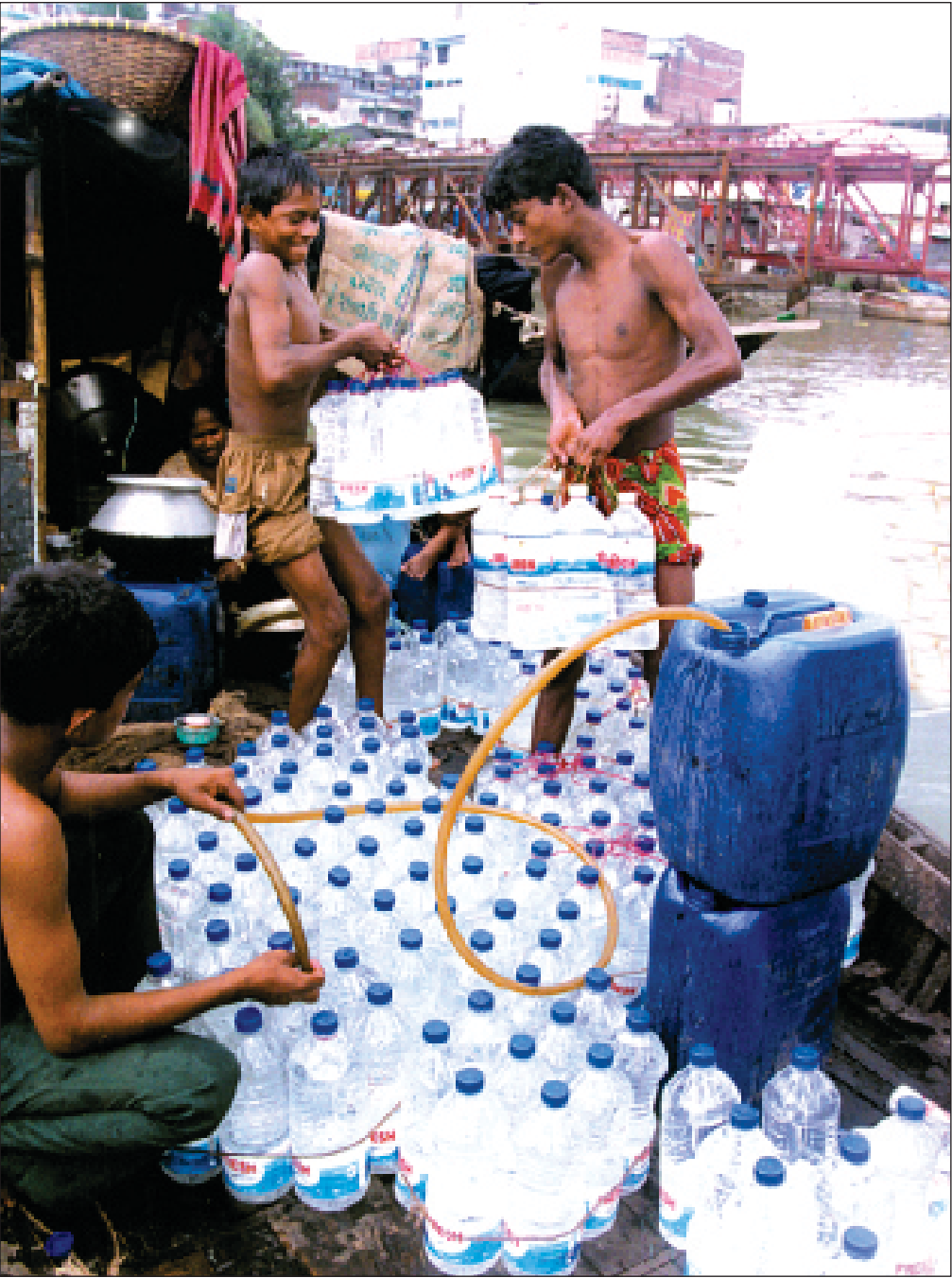
Children fill used plastic bottles with water for sale among unsuspecting people, posing a potential health risk when waterborne diseases rampage through much of Bangladesh.