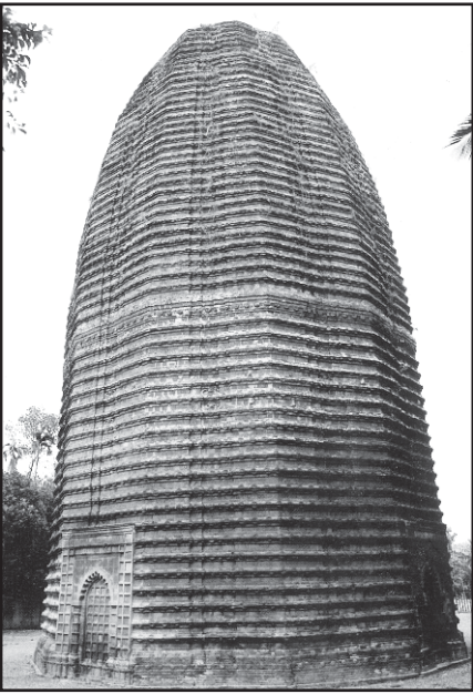
Mathurapur Deul, Madhukhali, Faridpur; built circa 16th century