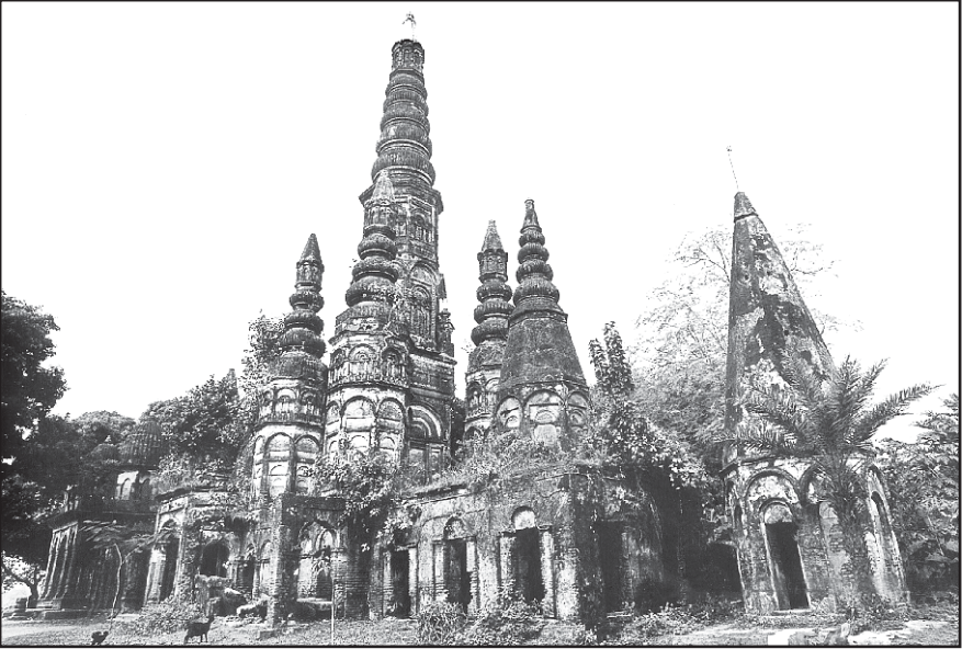
Kalinarayana Temple, Joydevpur, Gazipur; a Pancha Ratna type temple built circa late 19th century

Shilpalaya puts up photographs of a hundred temples scattered across the country. All these temples, built between the 16th and early 20th centuries, once had glorious moments, vibrant with religious rituals performed by devout followers. Exquisite terracotta embellishments, inimitable architectural innovations added to that glory. At present, however, almost all these temples are facing serious threat. Most of them have been discarded long ago. Trees have overgrown on them, causing damage to the plaster, pillars and other parts of these graceful architectural wonders.