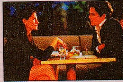
Notting Hill On HBO at 7:00 pm Genre: Comedy/Romance/Drama Julia Roberts, Hugh Grant

All programmes are in local time. The Daily Star will not be responsible for any change in the programme.