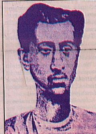
Hiralal Sen (1866-1917)