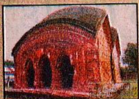
JOR-BANGLA GOPINATH TEMPLE, PABNA

Bangladesher Shoto Mandir (One Hundred Temple) Venue: Bengal Shilpalaya, 275/F, Road 27, Dhannomdi Time: August 01-10, 12pm-08pm