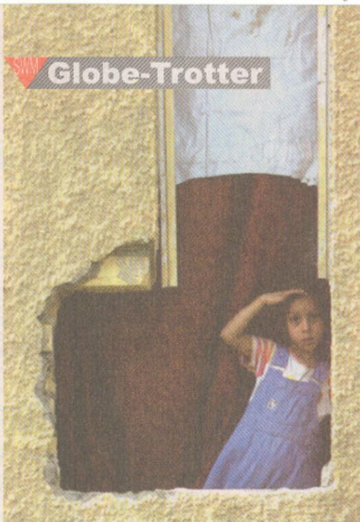
An Iraqi girl stands at the window of her family house as she observes Iraqi National Guardsmen patrolling her neighbourhood in Baghdad following pre-dawn clashes between insurgents and joint Iraqi and US forces July 2004. Twenty-five insurgents were killed and 17 wounded in a fierce battle yesterday against US troops in the flashpoint of Ramadi that also left 14 US servicemen injured, the US military said in a statement.