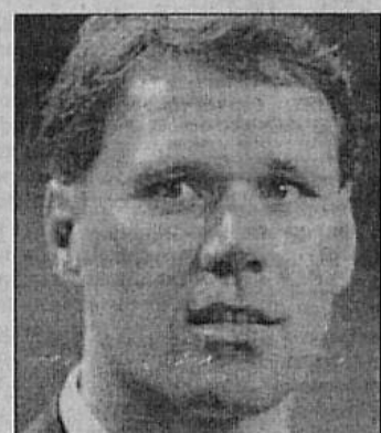
MARCO VAN BASTEN

If they accept the offer, the new Dutch coaching team will be made up