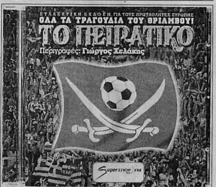
TREASURE CD! A CD called "The Pirate Ship" featuring live radio broadcasts from the European champions' Greece's games in the recent Euro 2004 tournament seen in a photo taken yesterday.

The CD's title refers to the Greek team's nickname "The Pirates," inspired by their defense-minded hit-and-run tactics. Its cover features a pirate flag in blue and white -- Greece's national colours -- where a football takes the place of a skull. The Greek national anthem and "Zorbas' Dance" are also included. Music records are declared "golden LPs" in Greece when they sell more than 25,000 copies. Rank outsiders' Greece stunning conquest of the cup had unleashed an unprecedented wave of enthusiasm in Greece. Millions poured out on the streets for an all-night party after the July 4 final in which Greece beat hosts Portugal 1-0.